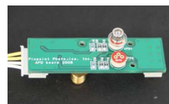
9mm pitched 2-APD /PD circuits (16mm width)

9mm pitch alignment is possible. optical analysis with 96 well plate is applicable