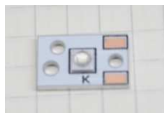
LED with 8.5mm width circuit