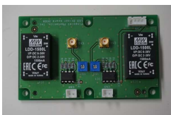
2ch LED Drivers